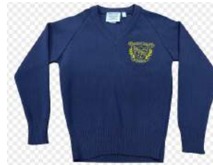
Navy poly/cotton jumper with school crest