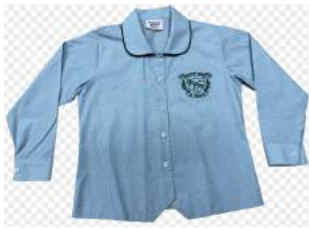
Girls long sleeve shirt