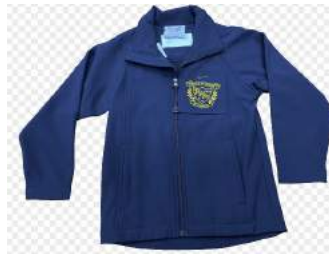
Navy universal jacket with school crest