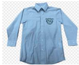
Boys long sleeve shirt