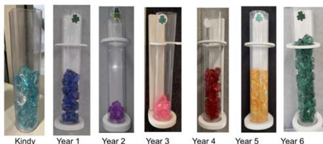
Kindy Year 1 Year 2 Year 3 Year 4 Year 5 Year 6