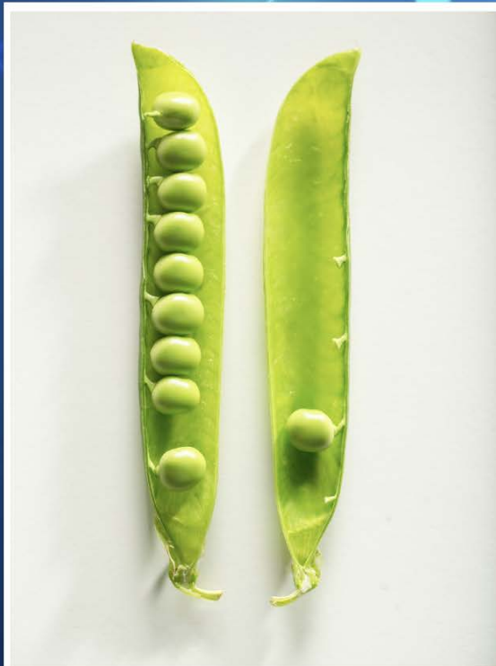
This is 1 pea pod split open.